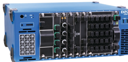
LTB-12 TWELVE-SLOT RACKMOUNT PLATFORM