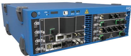
LTB-8 EIGHT-SLOT RACKMOUNT PLATFORM