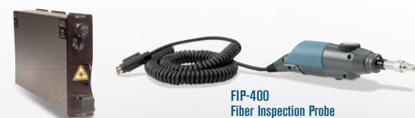
FTB-7500E Metro/Long-Haul OTDR