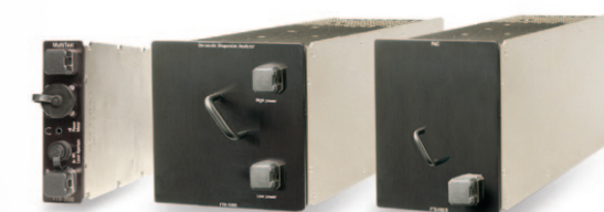
FTB-3930 MultiTest Module (OLTS)