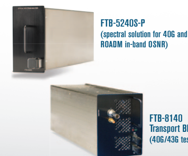
FTB-5240S-P (spectral solution for 40G and ROADM in-band OSNR)