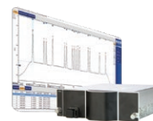
Optical spectrum analyzers FTBx-5245/FTBx-5255/ FTBx-5243-HWA